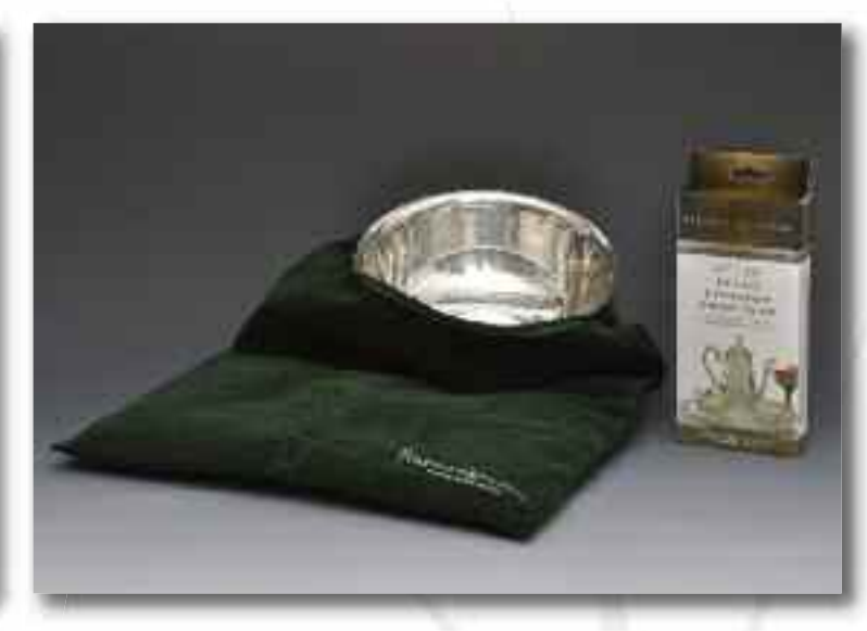
15" x 15" Tarnish Prevention Zipper Pouch

Perfect for protecting silver giftware and holloware. A revolutionary innovation for preventing tarnish.